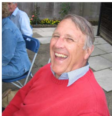
The outgoing President!

Our Centenary Year has been full of fun, friendship and thoroughly enjoyable cricket and golf. I will long treasure the memory of walking round the beautiful Arundel Castle Cricket Ground in glorious weather on Sunday 7 th August and seeing so many Martlets, past and present, enjoying each others' company and reminiscing about great deeds performed. Numerous anecdotes were exchanged and the odd embellishment further added to the wonderful atmosphere of nostalgia and camaraderie.