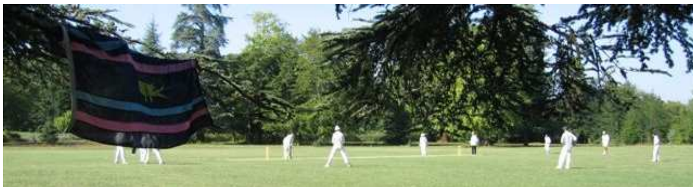
The Martlet flag flutters over France ... !