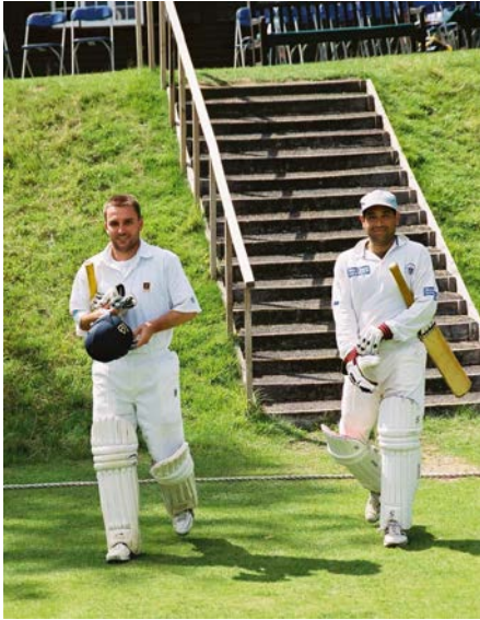
The Duke's men.