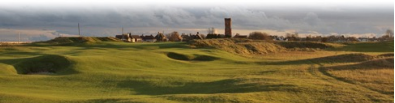
Littlehampton Golf Course