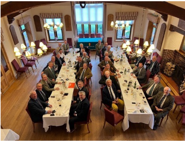
Sussex Martlets and guests pictured from the gallery overlooking the dining room at West Sussex G.C.

constraints. It is hoped that a final draft will be possible towards the end of 2025 before publication.